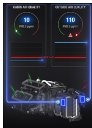
The new MAHLE approach allows a real time monitoring of cabin and outside air quality (picture exemplary).

by these filters is near constant over their entire lifetimes, ensuring good cabin air in the long term. Fine particulates, solid particles, harmful gases, and environmental odors in the incoming air are reliably kept out of the vehicle cabin. Typical particles, such as brake dust, diesel soot, and tire debris, which are produced and transported by traffic on the road ahead, do not enter the cabin. The sensors integrated into the smart air conditioning system from MAHLE also ensure optimal service life for the filter elements. Furthermore, the filter protects the components within the air conditioning system from exposure to polluted air.