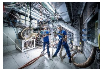
Many MAHLE core competences like thermal management are highly relevant for fuel cell applications. In this picture, MAHLE employees are testing cooling systems for fuel cell applications.